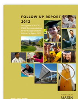
Follow-Up Report 2012