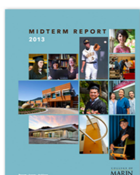
Midterm Report 2013

The links below direct to College of Marin's report, evidence, and response from ACCJC for each given year.