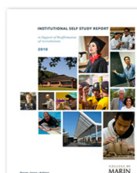
Self Study Report 2010