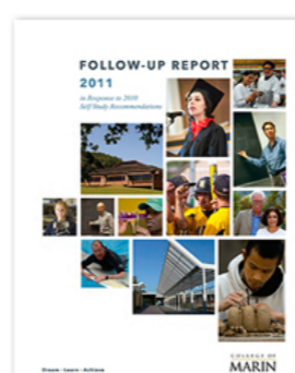
Follow-Up Report 2011