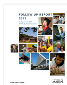
Follow-Up Report 2011