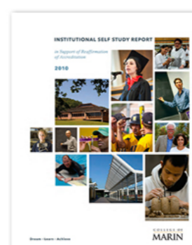
Self Study Report 2010