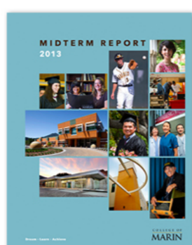
Midterm Report 2013

The links below direct to College of Marin's report, evidence, and response from ACCJC for each given year.