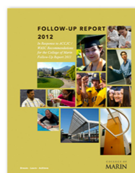
Follow-Up Report 2012