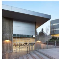
Events and Activities