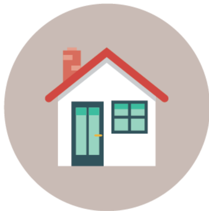
Housing and Shelter