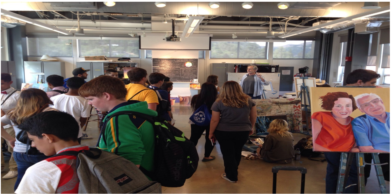
COMPASS Terra Linda High School students touring an art class on their field trip to the KTD campus.