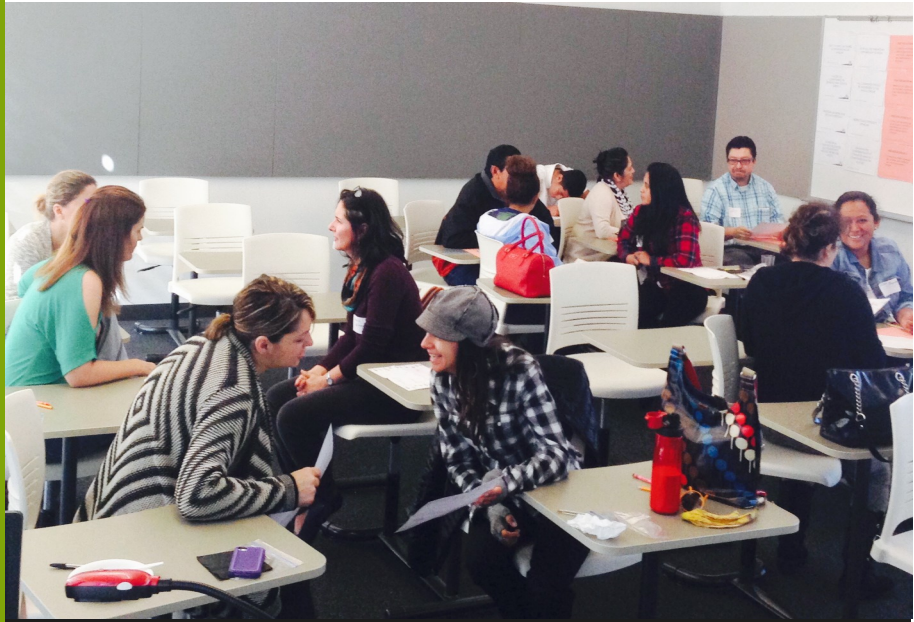
Parents of COMPASS students from Terra Linda High School at a workshop learning how to help their students achieve their college goals. Many parents are considering taking COM classes right alongside their students!