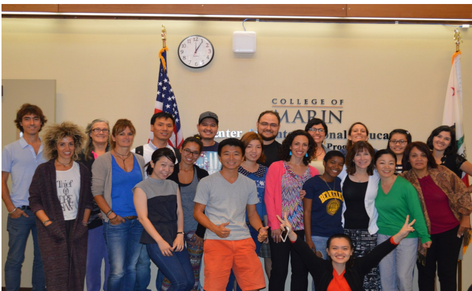
Fall semester kick-off for International Education Program students, staff and faculty.

Vice President of Student Learning & Student Services